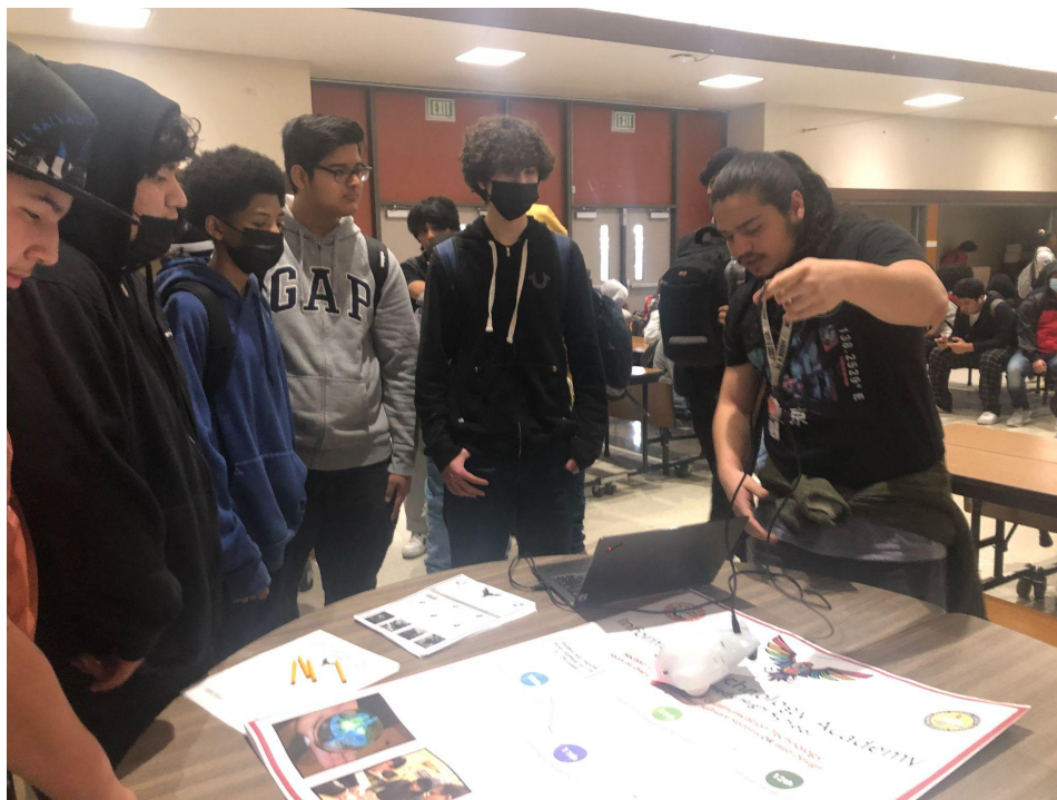
A current upperclassman in the Information Technology Academy demonstrates a robot for 9th graders.