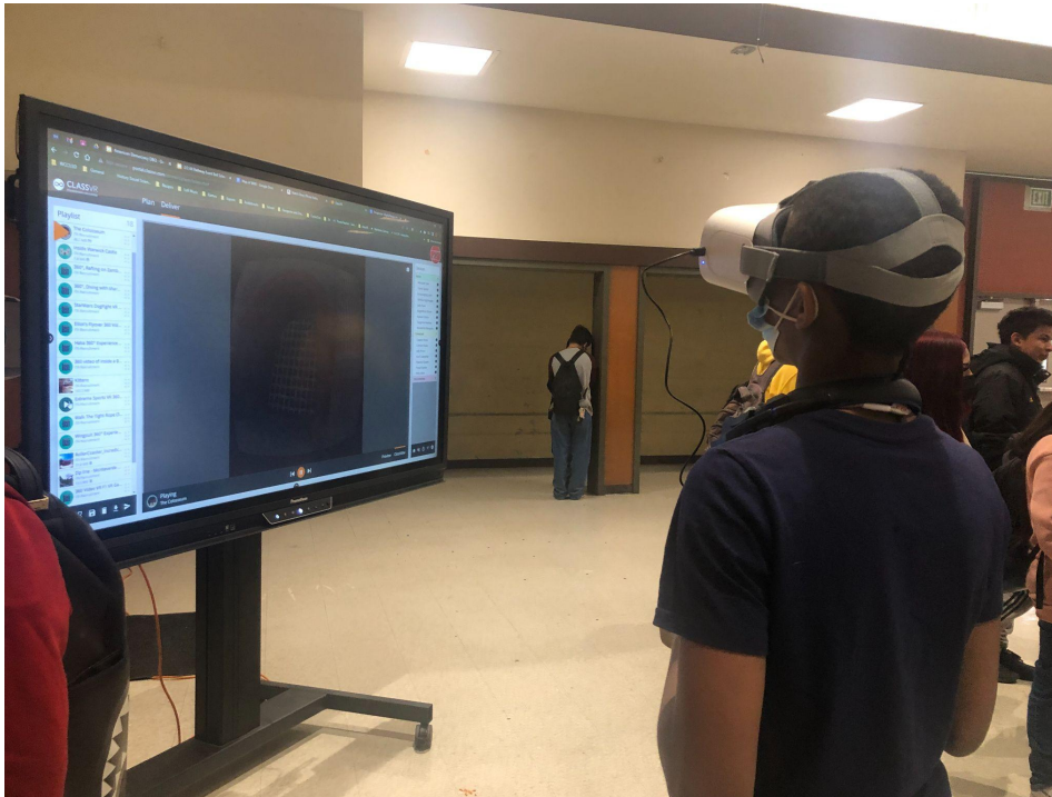
Kennedy 9th grader uses one of the Information Technology Academy's Virtual Reality headsets to explore real historical sites, such as the ancient Roman Coliseum.